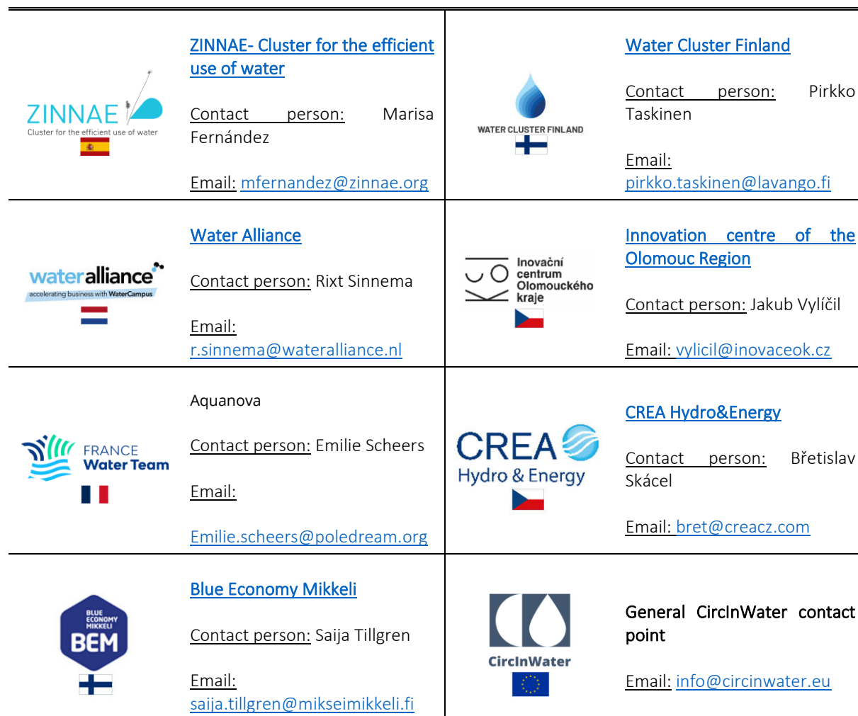
Table 3. Contact information.

For any queries about the CirclnWater project, see the contact information in Table 3: