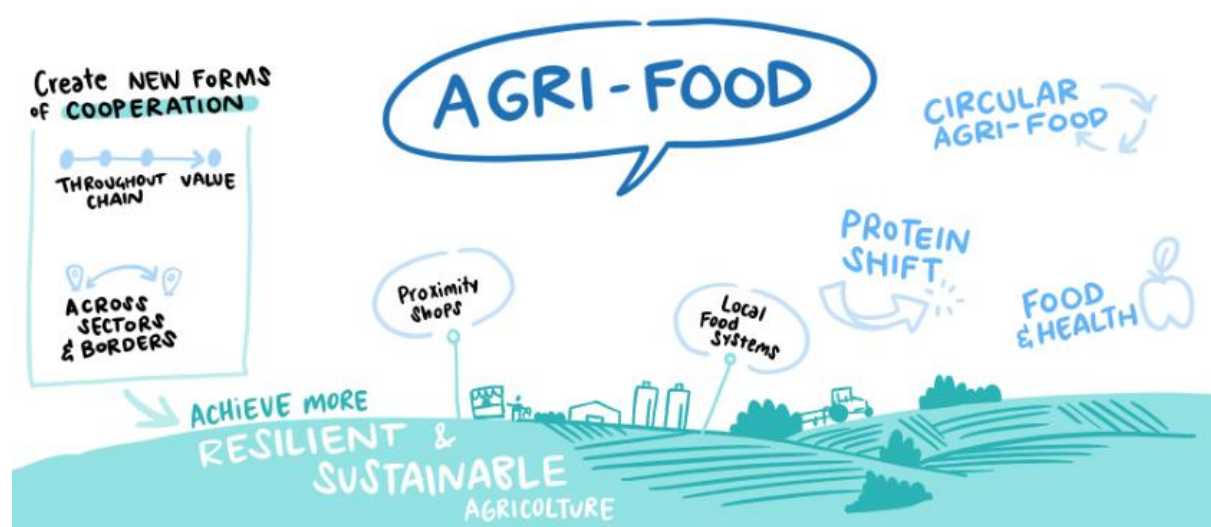
Figure 2.- Agri-food ecosystem. © Norma Nardi 2020.

Agriculture land plays an important role in land use patterns across the EU. Due to accelerating population growth, urbanisation, and climate change, competition for water resources is expected to increase, with a particular impact on agriculture. Agriculture is the biggest water-consuming sector accounting for an estimated 72% of global freshwater withdrawals 34 .