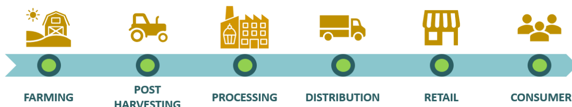
Figure 3. Agri-food value chain.

CirclnWater project aims to support those SMEs promoting the development and implementation of water-smart solutions that address the water-related challenges in the whole agri-food ecosystem and value chain (Figure 4). For example, this can be water challenges in greenhouses to challenges in a brewery or a meat processing factory.